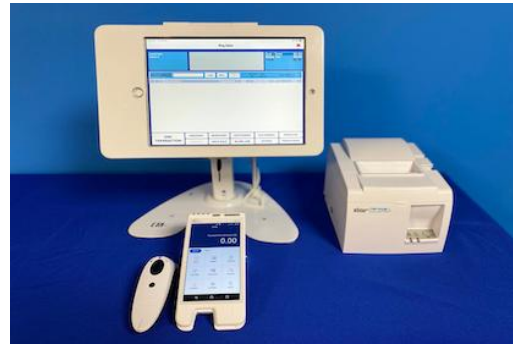
Ring in the New

Lightning can help you with a specially curated suite of smart, sleek and sexy check out hardware guaranteed to: